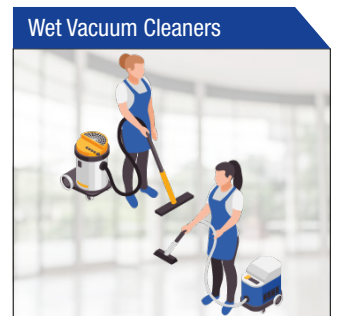
Wet Vacuum Cleaners